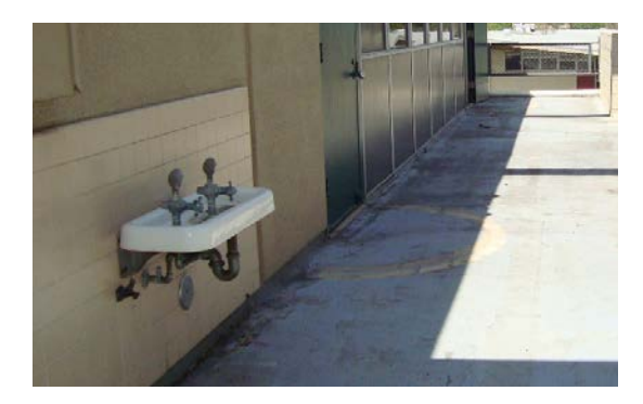
Accessible hi-lo drinking fountains are required.