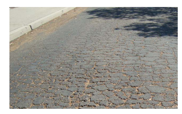
AC paving poor at parking lot.