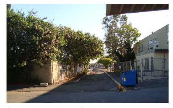
Drainage issues at the south of campus.

ANAHEIM UNION HIGH SCHOOL DISTRICT Facilities Master Plan