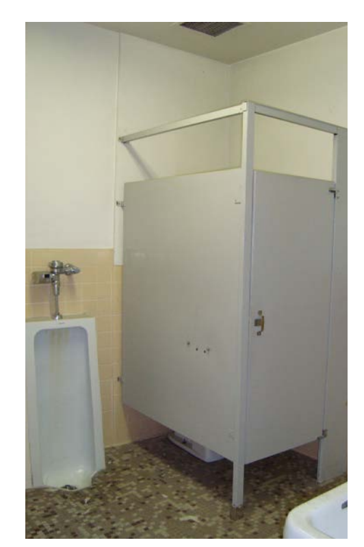
Provide ADA accessible restrooms.