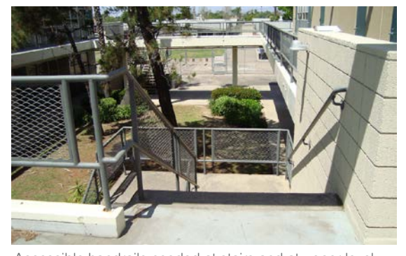
Accessible handrails needed at stairs and at upper level.