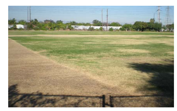
Replace irrigation, provide accessibility, rehabilitate fields & track.