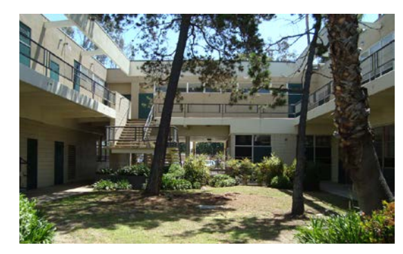
No ADA access to upper level. Provide elevator.