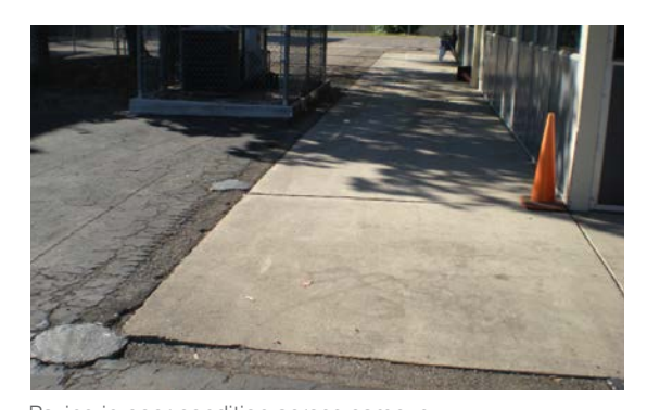
Paving in poor condition across campus.