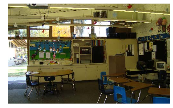
Classrooms require modernization with special needs.