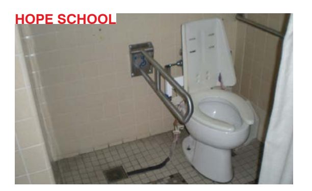
Additional specialized toilet facilities are needed.