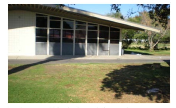
Landscape and irrigation in need of renovation.