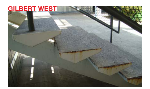
Stairs in poor condition.